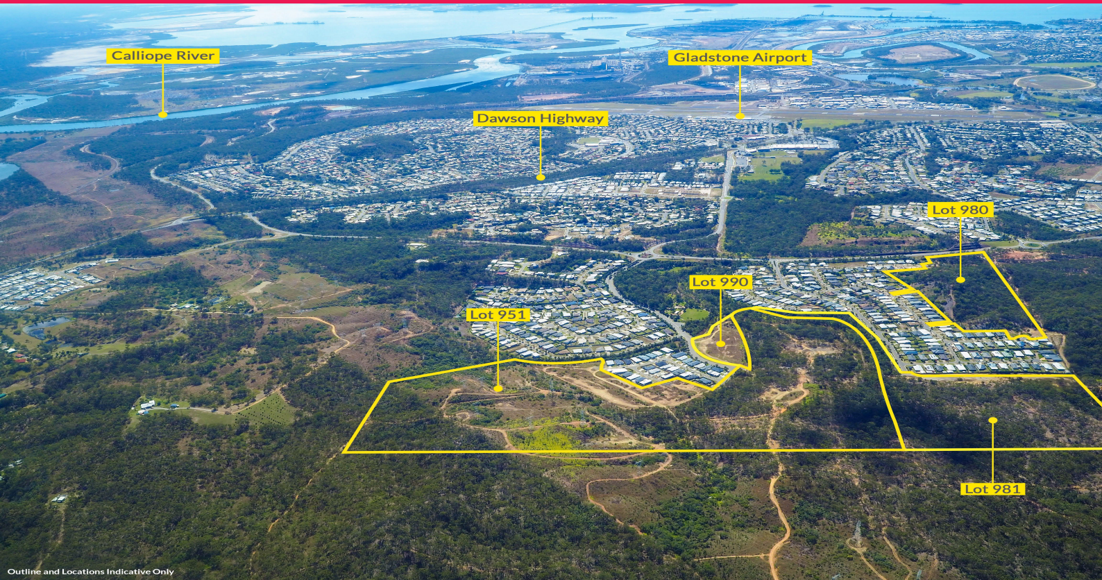
Outline and Locations Indicative Only