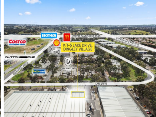
9/1-5 Lake Drive, Dingley Village VIC 3172