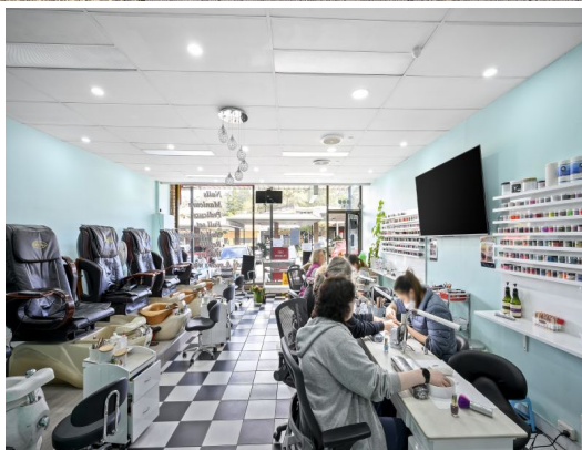
5/9-21 MAIN STREET, UPWEY