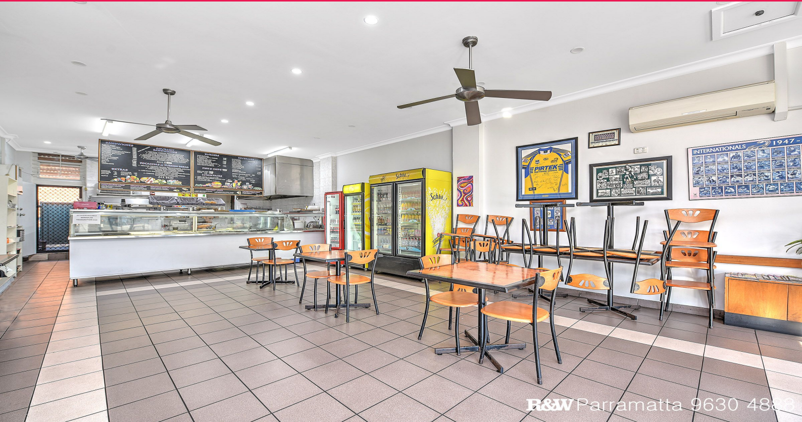
R&W Parramatta 9630 4888