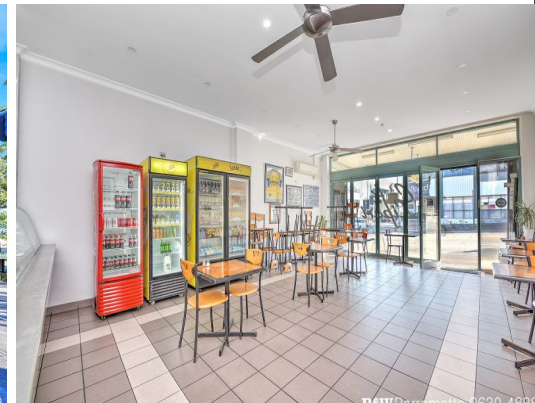
R&W Parramatta 9630 4888