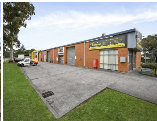
4/31 RUSHDALE STREET, KNOXFIELD