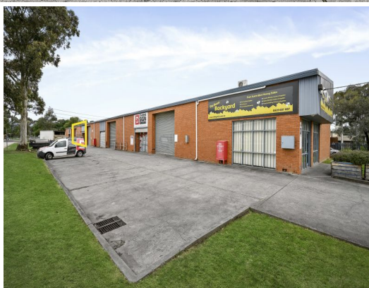
4/31 RUSHDAL STREET, KNOXFIELD