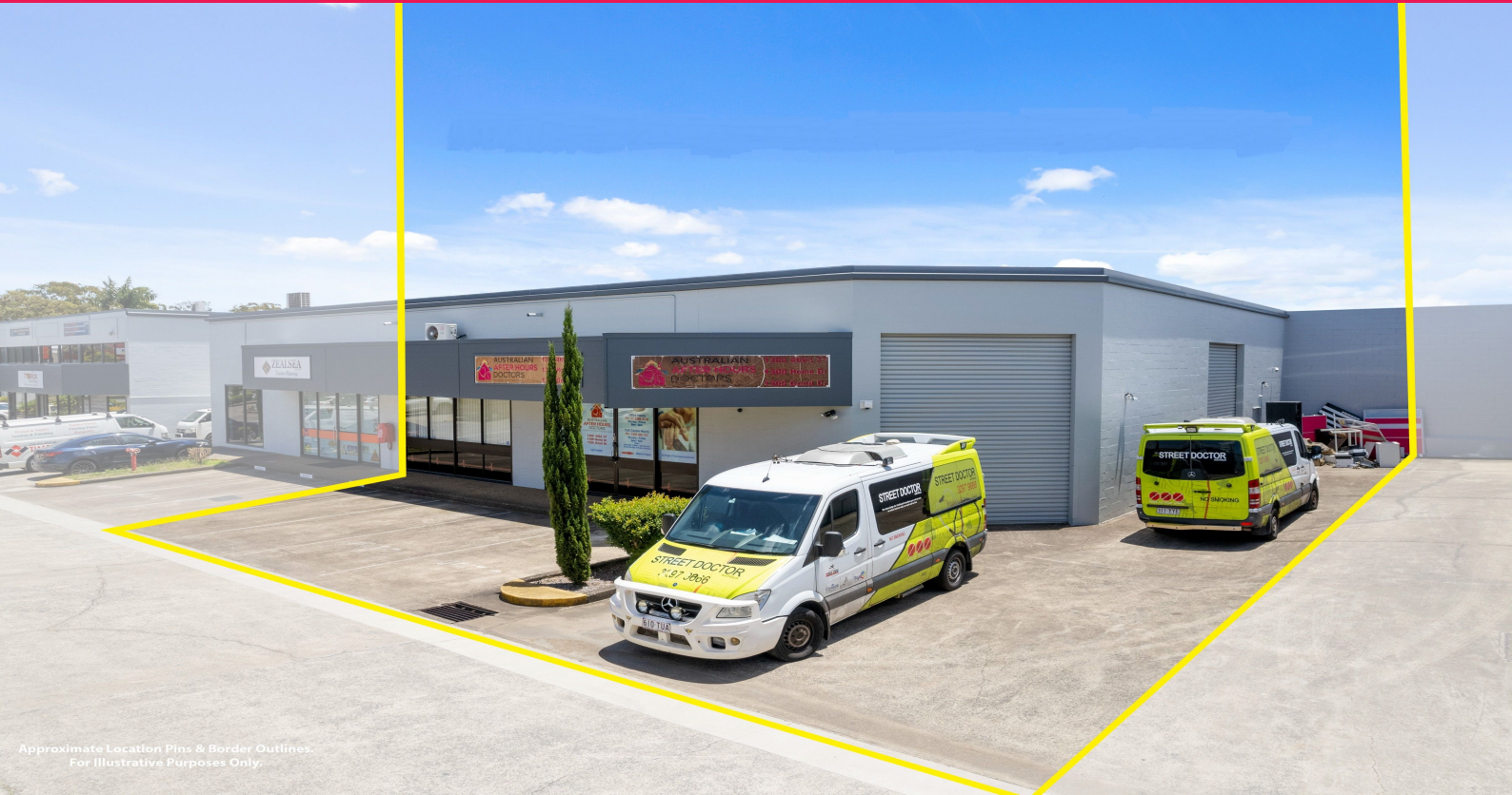
Approximate Location Pins & Border Outlines. For Illustrative Purposes Only.