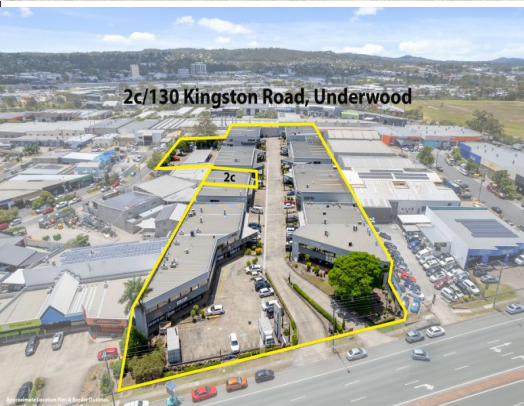
2c/130 Kingston Road, Underwood