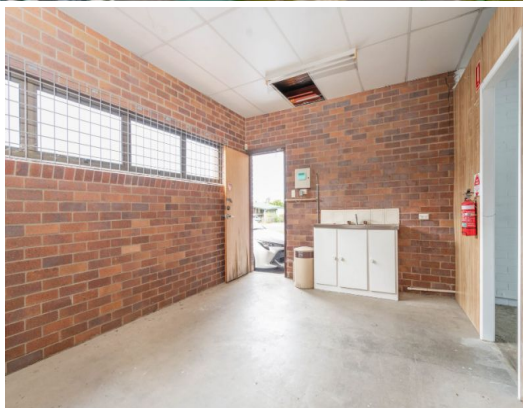
84 Grange Road, EASTERN HEIGHTS