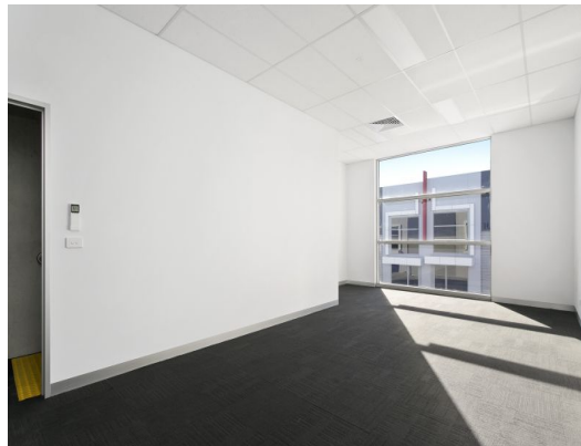
11/8-10 MONOMEETH DRIVE, MITCHAM