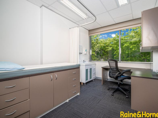
Suite 1.27/4 Hyde Parade, Campbelltown NSW 2560