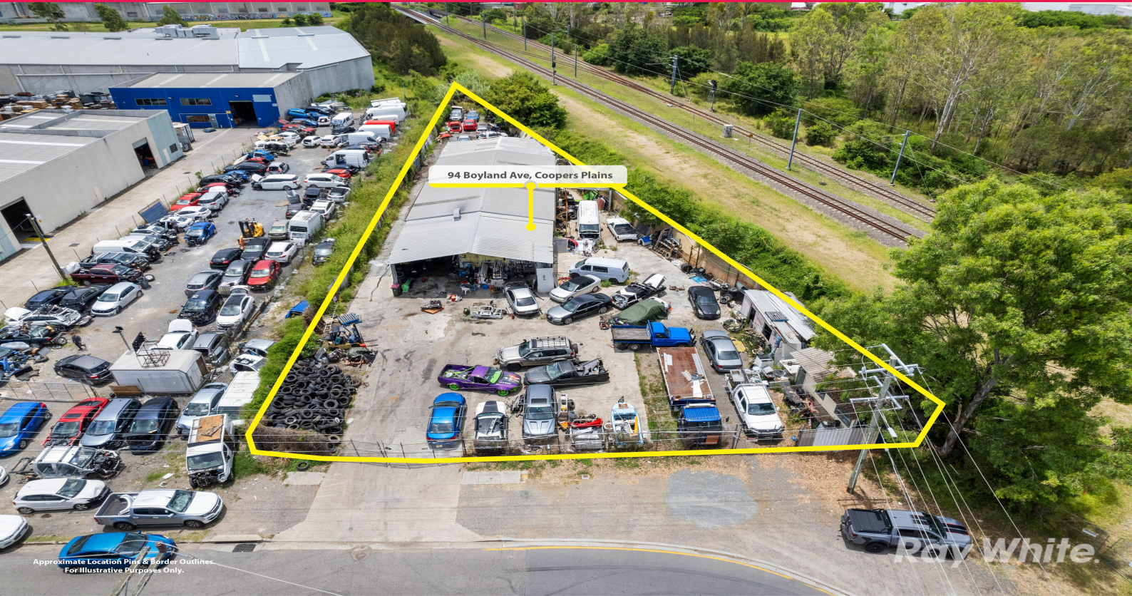
Approximate Location Pins & Border Outlines. For Illustrative Purposes Only.