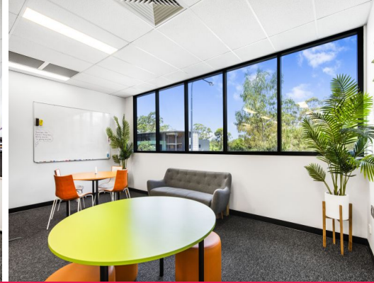
20a/8 Fairfax Street, Sippy Downs QLD 4556