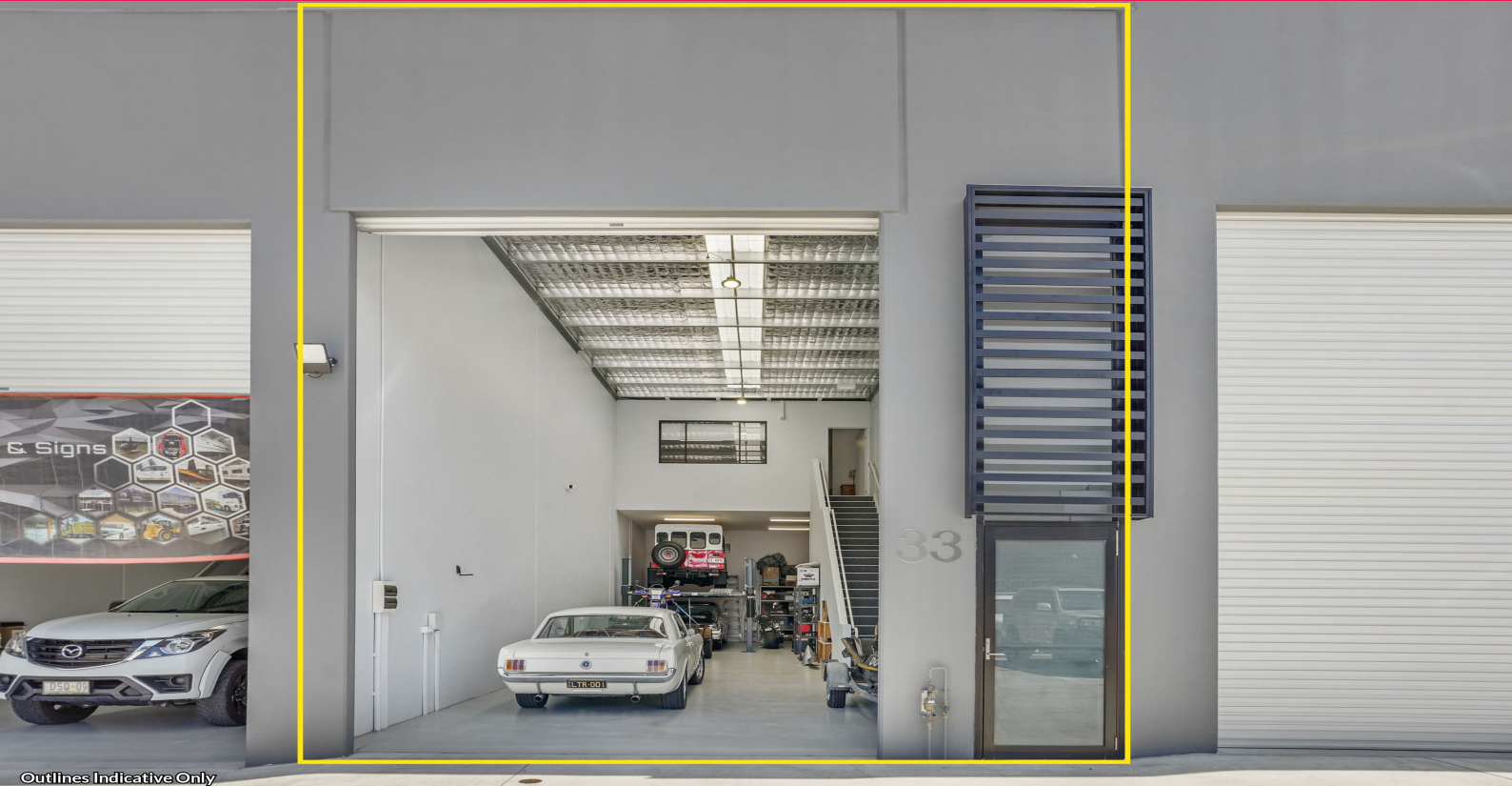
Outlines Indicative Only