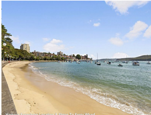
Harbour Esplanade Location & Steps To Ferry Wharf