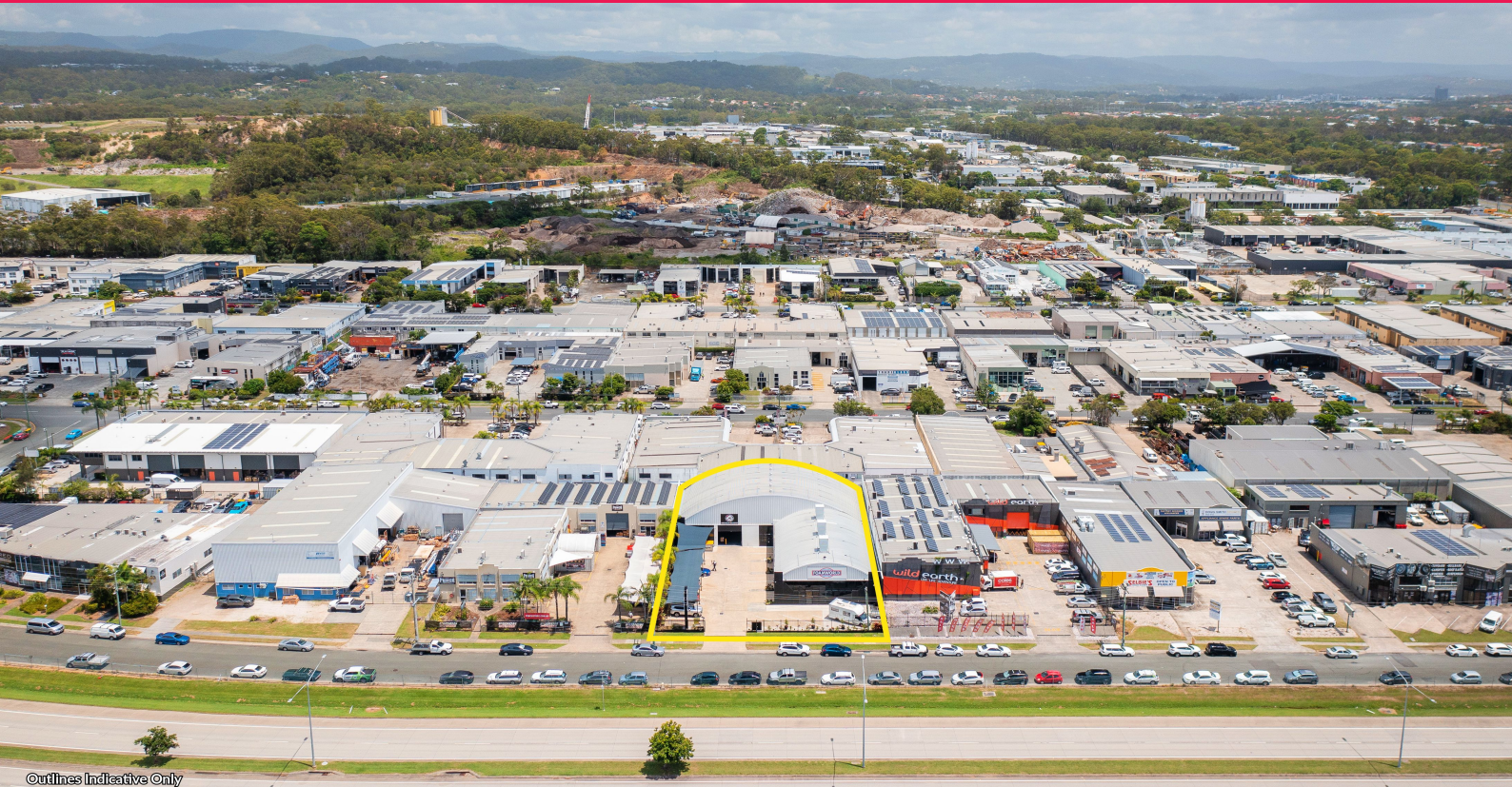
Outlines Indicative Only