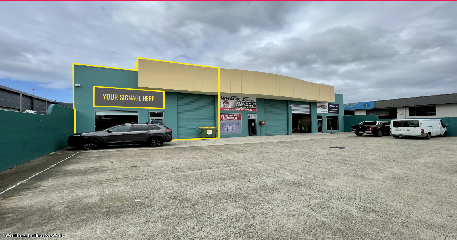
Outlines Indicative Only