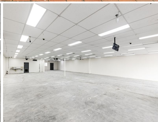
154-156 CANTERBURY ROAD, HEATHMONT