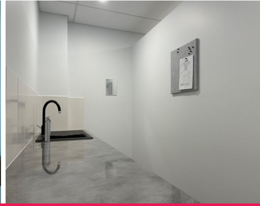
10/21-25 Lake Street, Cairns City QLD 4870