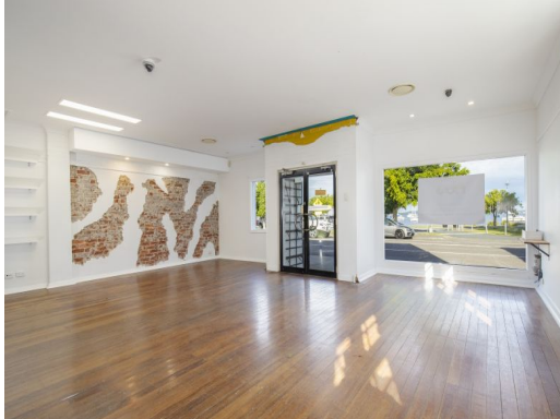
38 Brooks Parade, Belmont NSW 2280