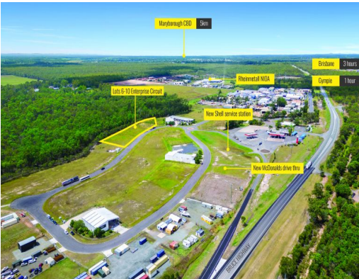
Lots 6-10 Enterprise Circuit, Maryborough QLD 4650