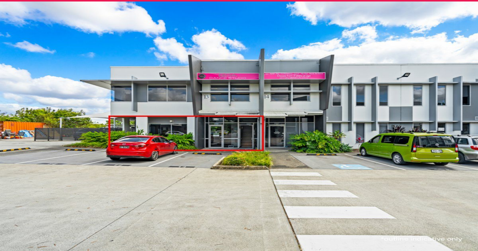
*outline indicative only