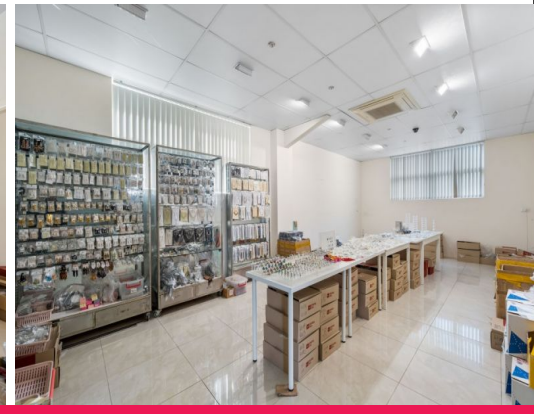
6/19-21 Norman Street, Peakhurst NSW 2210