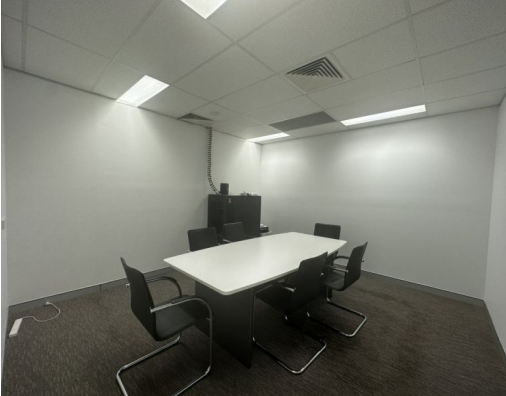
Etysl41,18ldg 2, Par/2740 Logan Road, Eight Mile Plains