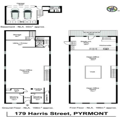
Whole/179 Harris Street, Pyrmont NSW 2009