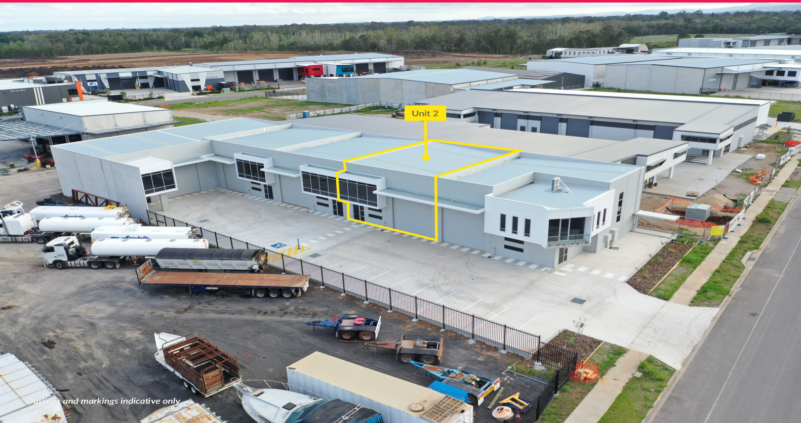
Outlines and markings indicative only