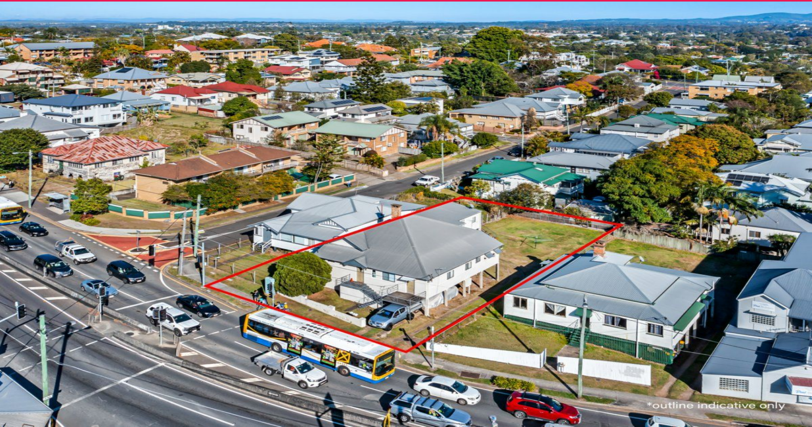
*outline indicative only