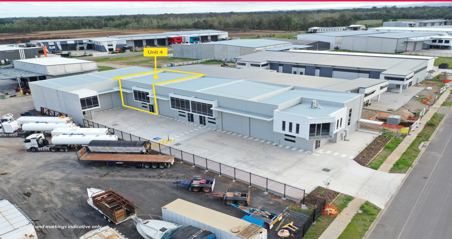
Outlines and markings indicative only