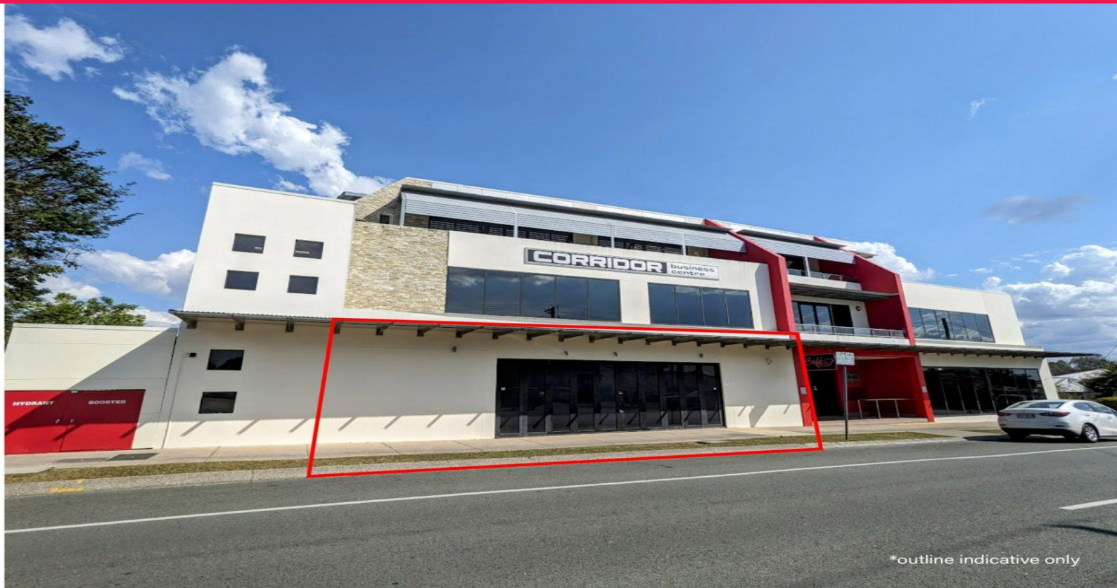
*outline indicative only