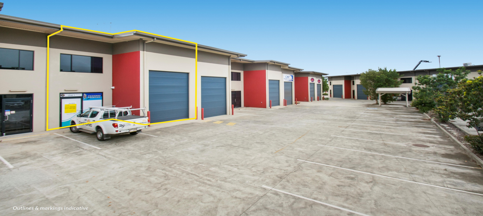
Outlines & markings indicative