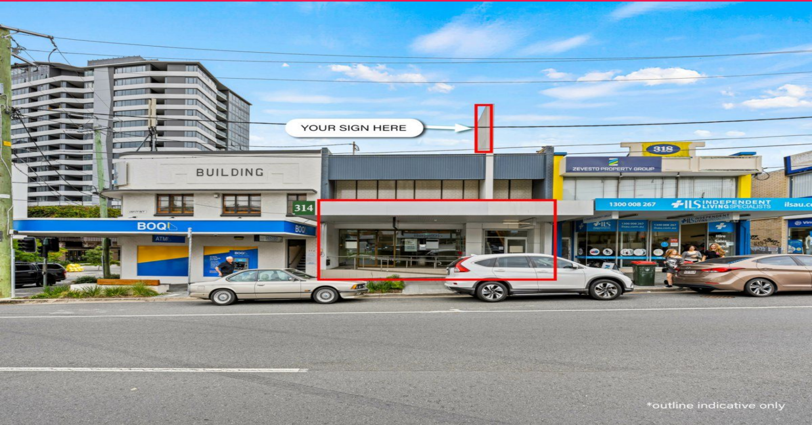
*outline indicative only