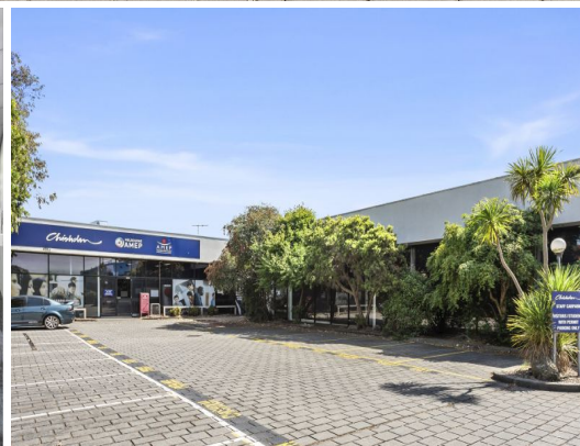
A-B/126 SPRINGVALE ROAD, SPRINGVALE