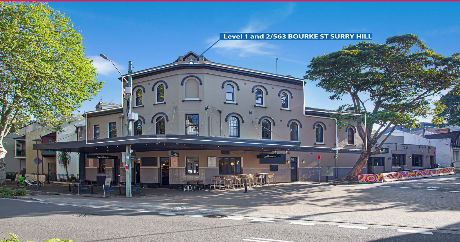
Level 1 and 2/563 BOURKE ST SURRY HILL