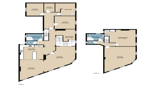
Level 1 & 2/563 Bourke Street, SURRY HILLS