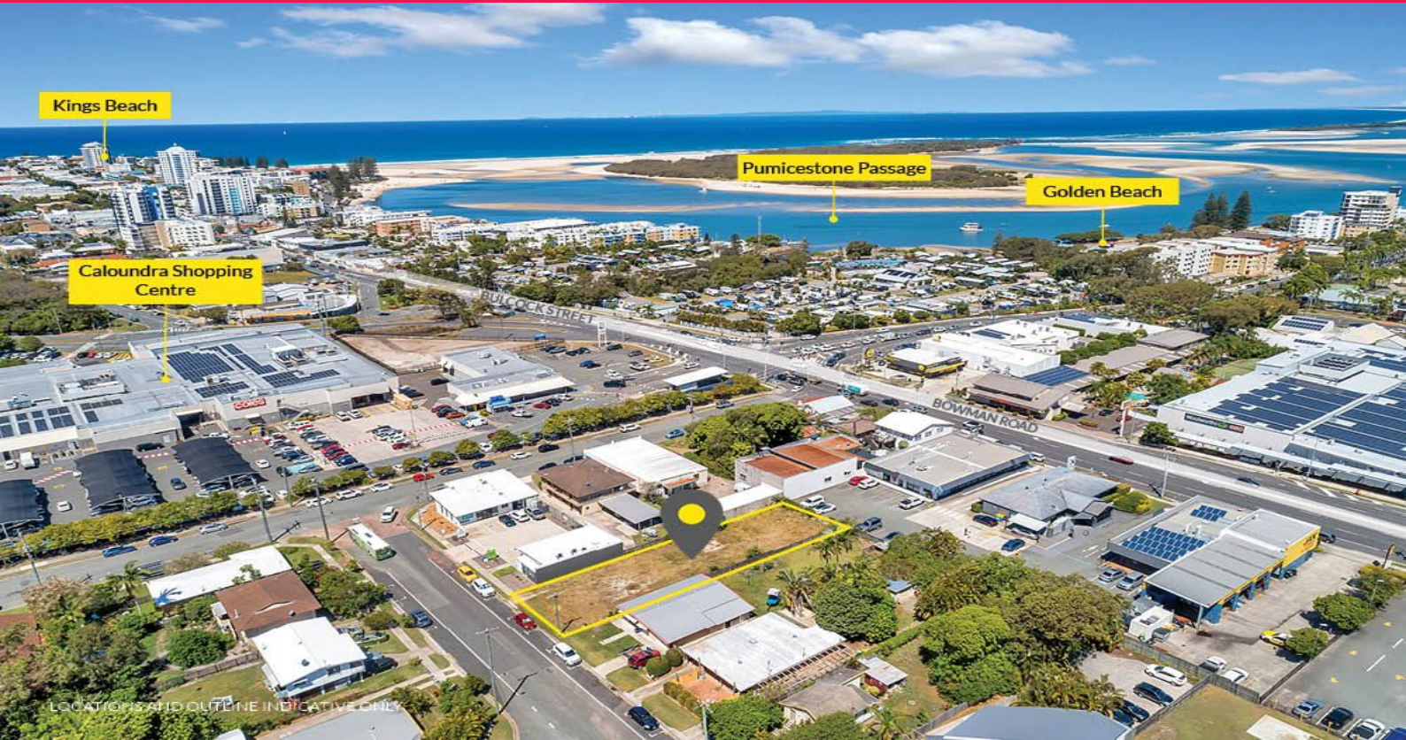
LOCATIONS AND OUTLINE INDICATIVE ONLY