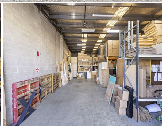
2/42 BURGESS ROAD, BAYSWATER NORTH