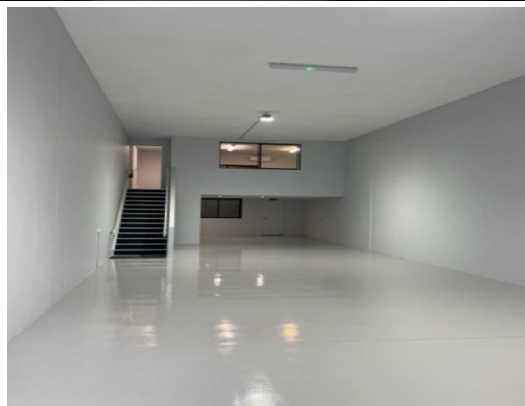
ASHMORE BUSINESS CENTRE - 10A INDUSTRIAL AVENUE, MOLENDINAR