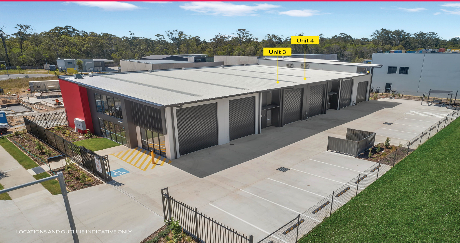
LOCATIONS AND OUTLINE INDICATIVE ONLY