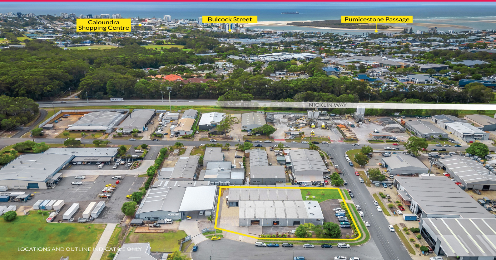
LOCATIONS AND OUTLINE INDICATIVE ONLY