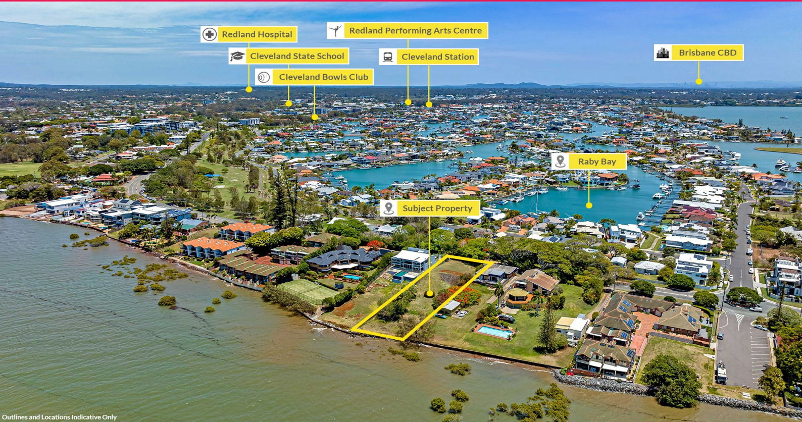
Outlines and Locations Indicative Only