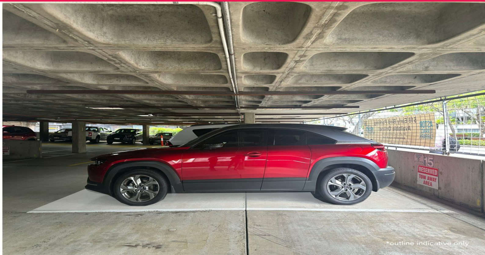
*outline indicative only