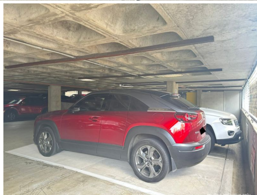
*outline indicative only