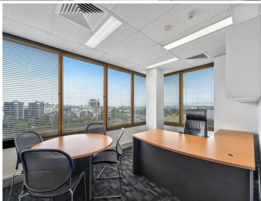
SUITE 502, LEVEL 5 303 Coronation Drive | Milton