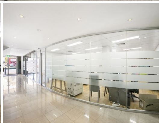
2/1014 DONCASTER ROAD, DONCASTER EAST