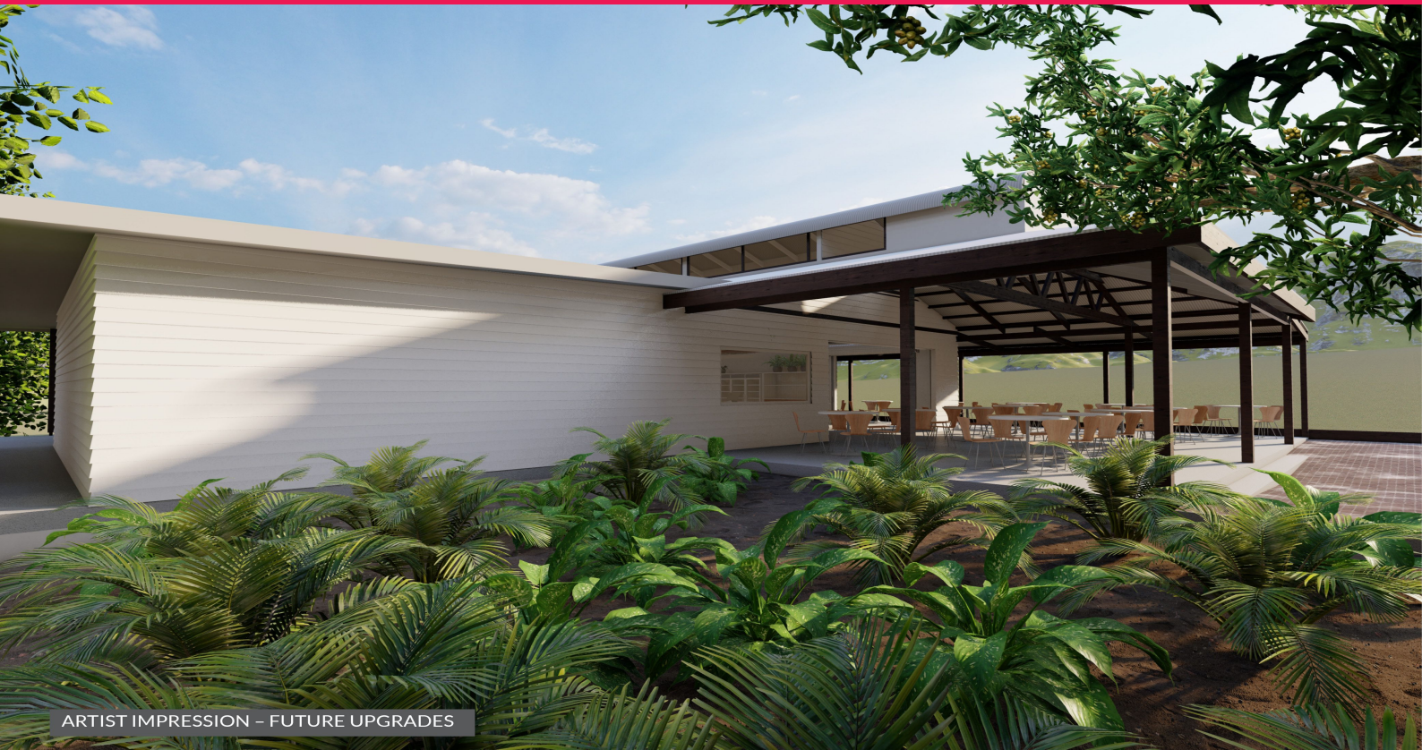
ARTIST IMPRESSION - FUTURE UPGRADES