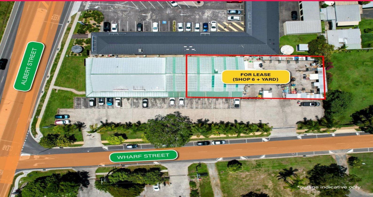
*outline indicative only