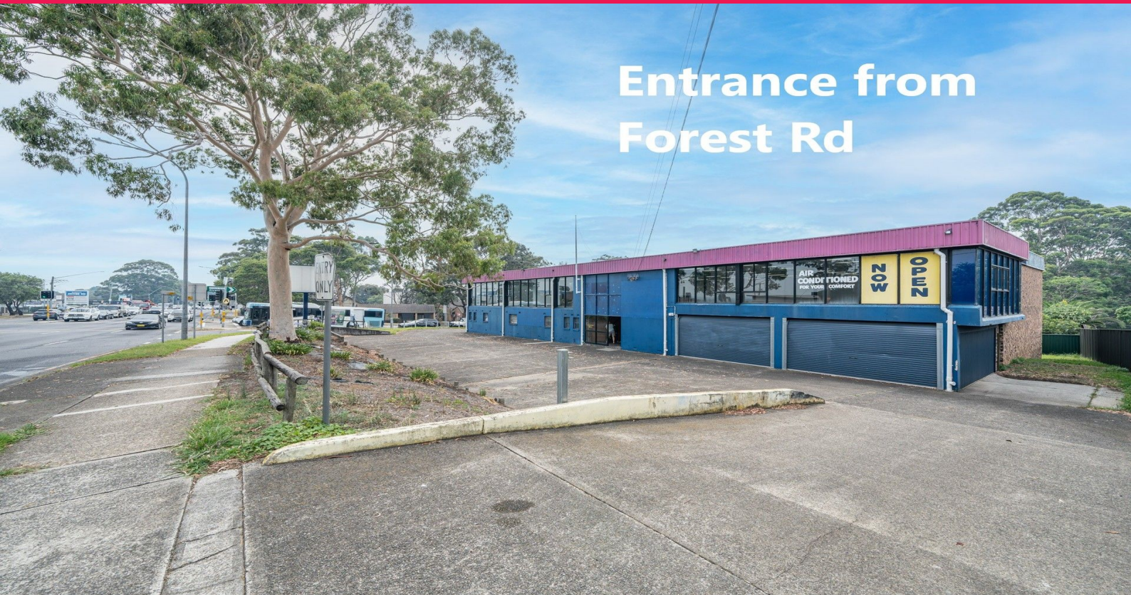
Entrance from Forest Rd