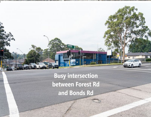
Busy intersection between Forest Rd and Bonds Rd