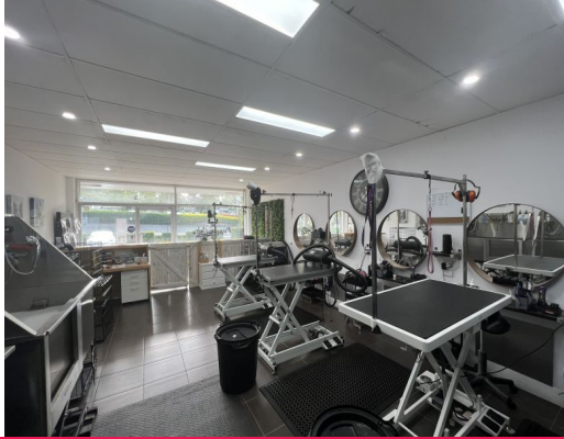
3/2-4 Bulwarna Street, Loganholme QLD 4129