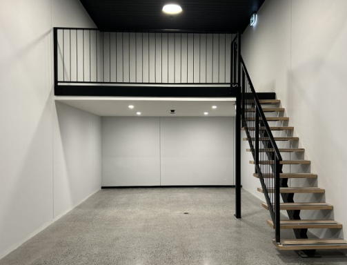
Flexie 32/64 Willow Avenue, Springvale VIC 3171