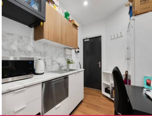
Tenancy 1/31 Thomas Street, Noosaville QLD 4566