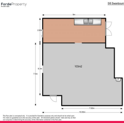
5/6 Swanbourne Way, Noosaville QLD 4566