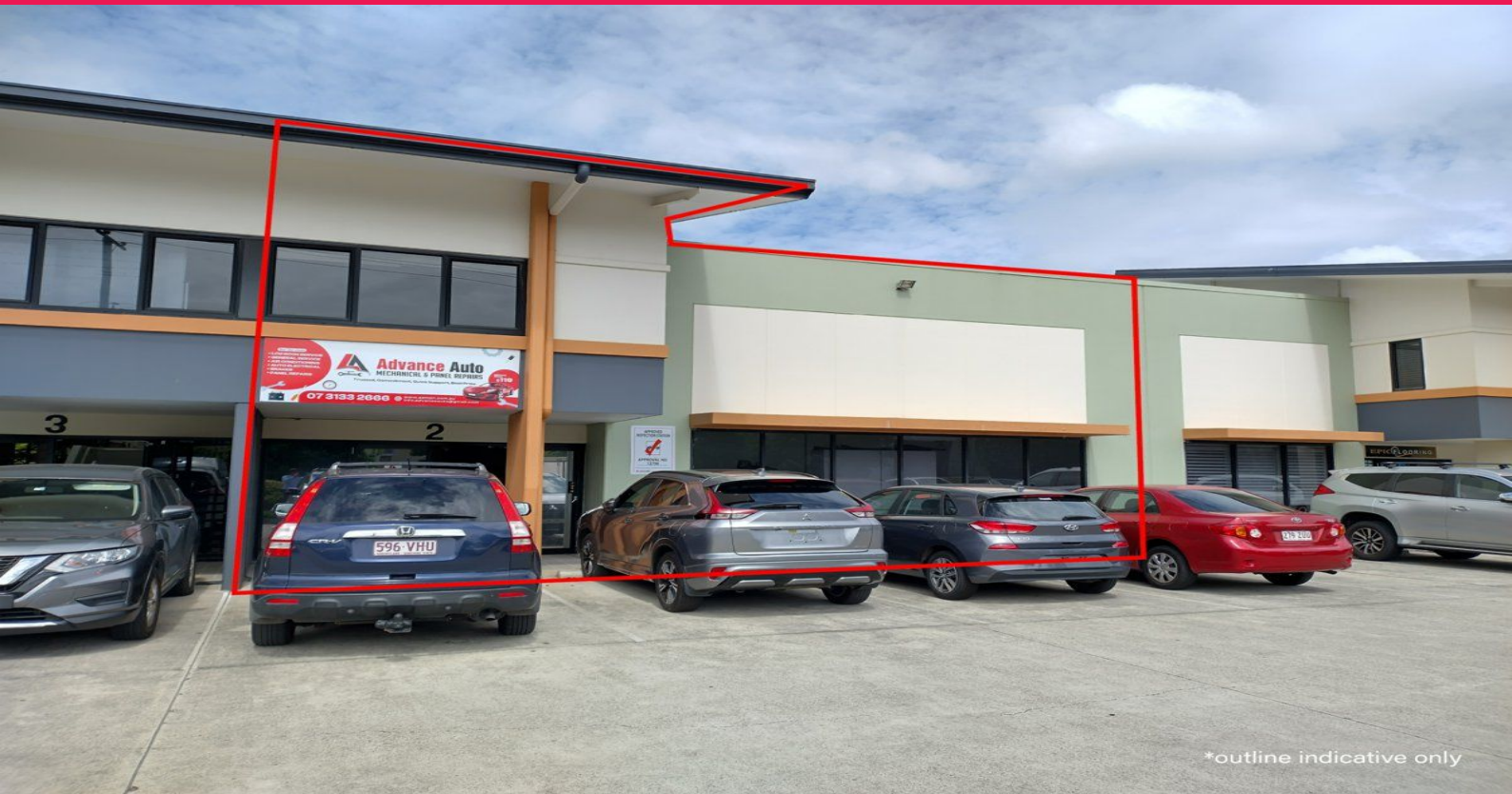
*outline indicative only