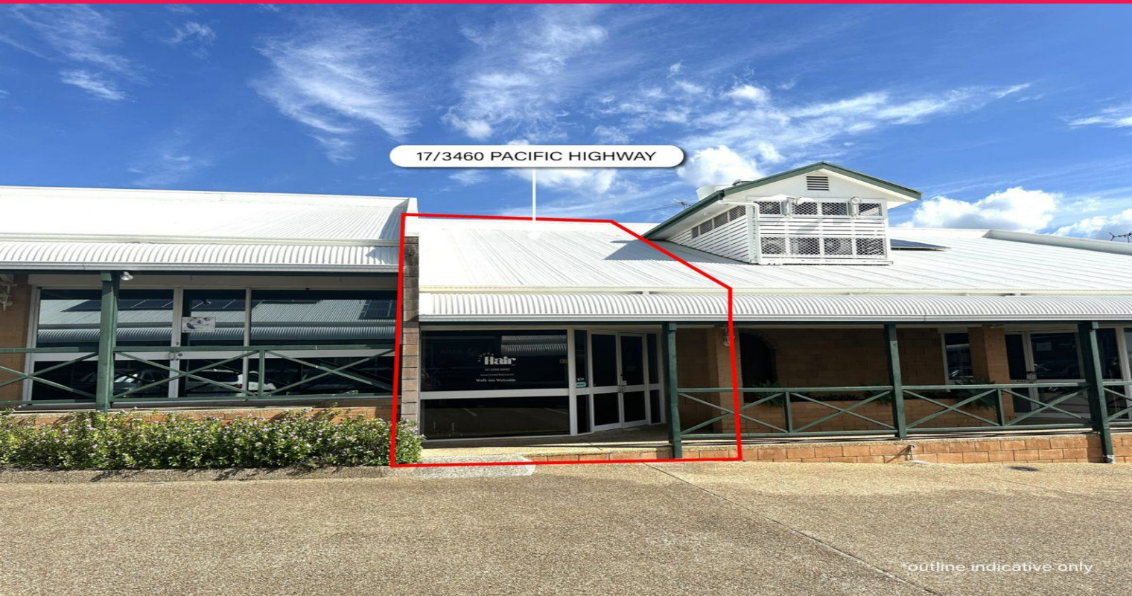
outline indicative only