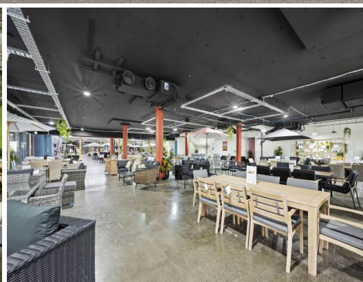
4/194 WHITEHORSE ROAD, BLACKBURN